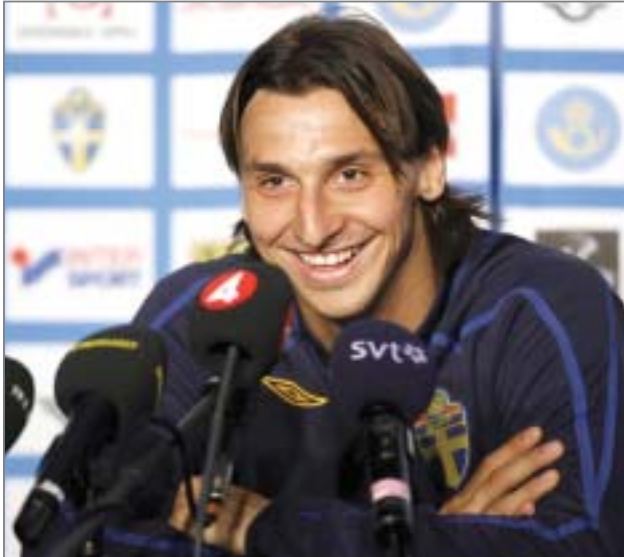
Swedish forward Zlatan Ibrahimovic attends a press conference at the Swedish training camp in Lugano, Switzerland, on June 8.

Meanwhile on Thursday Croatia face Germany while Austria host Poland. In Group C and on Friday Italy meet Romania and in peak of the group game The Netherlands face France.