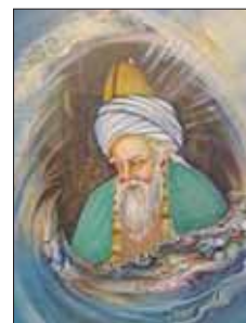
A portrait of Molana Jalaeddin Rumi to honor the renowned literary figure.