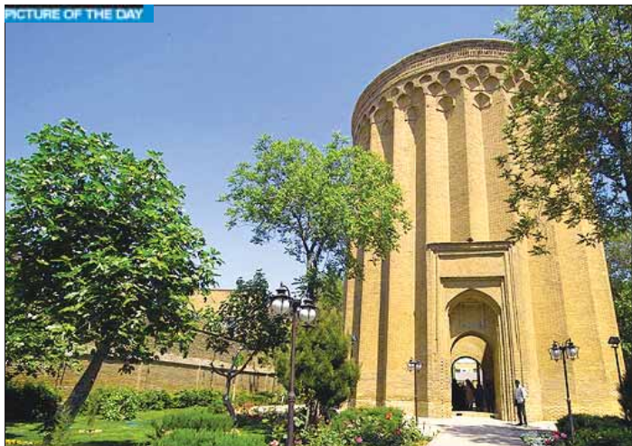
Toghrol Tower in ancient city of Shah-e Rey, Tehran province