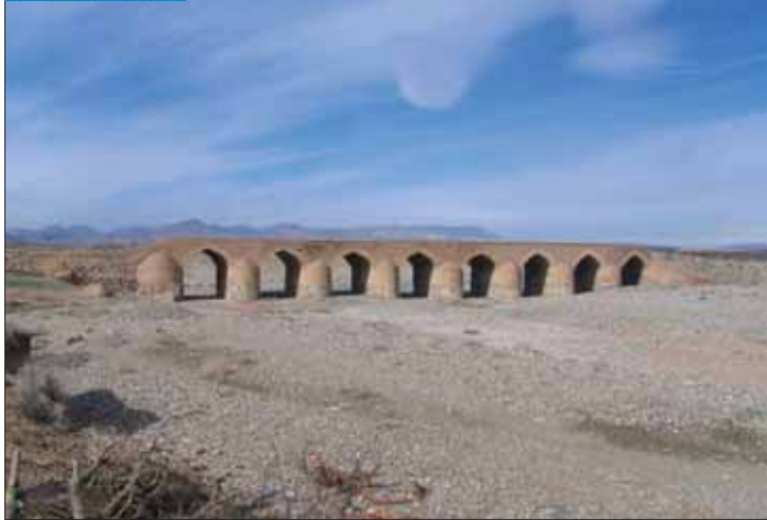
A view of Poi-e Shah Abbasi (King Abbasi bridge) in Sorkheh village of Saveh, Markazi province